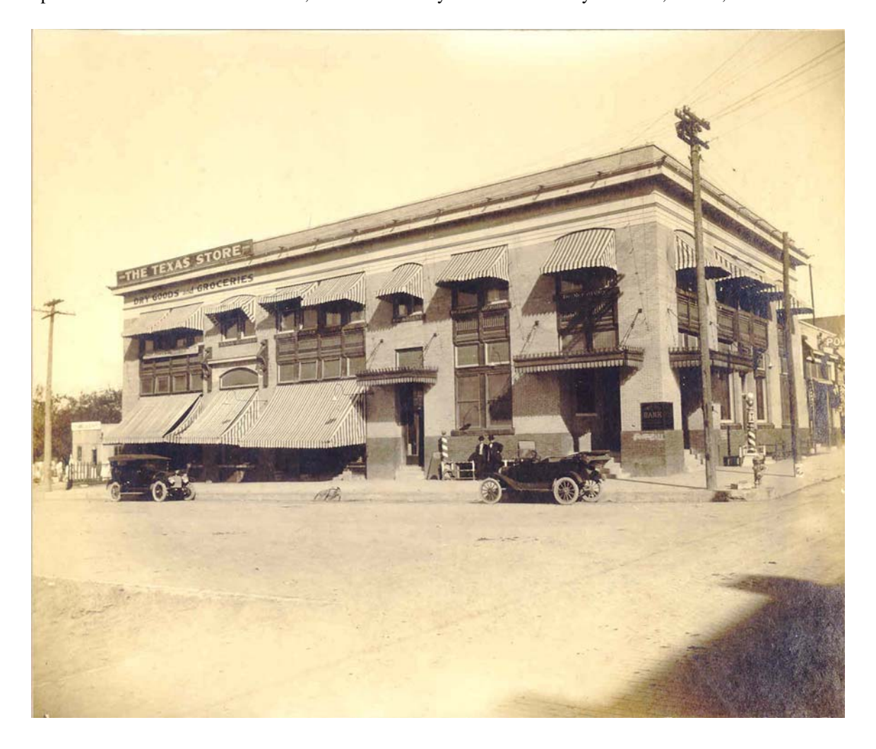
Figure 3. Temple State Bank and the Texas Store, c. 1915.