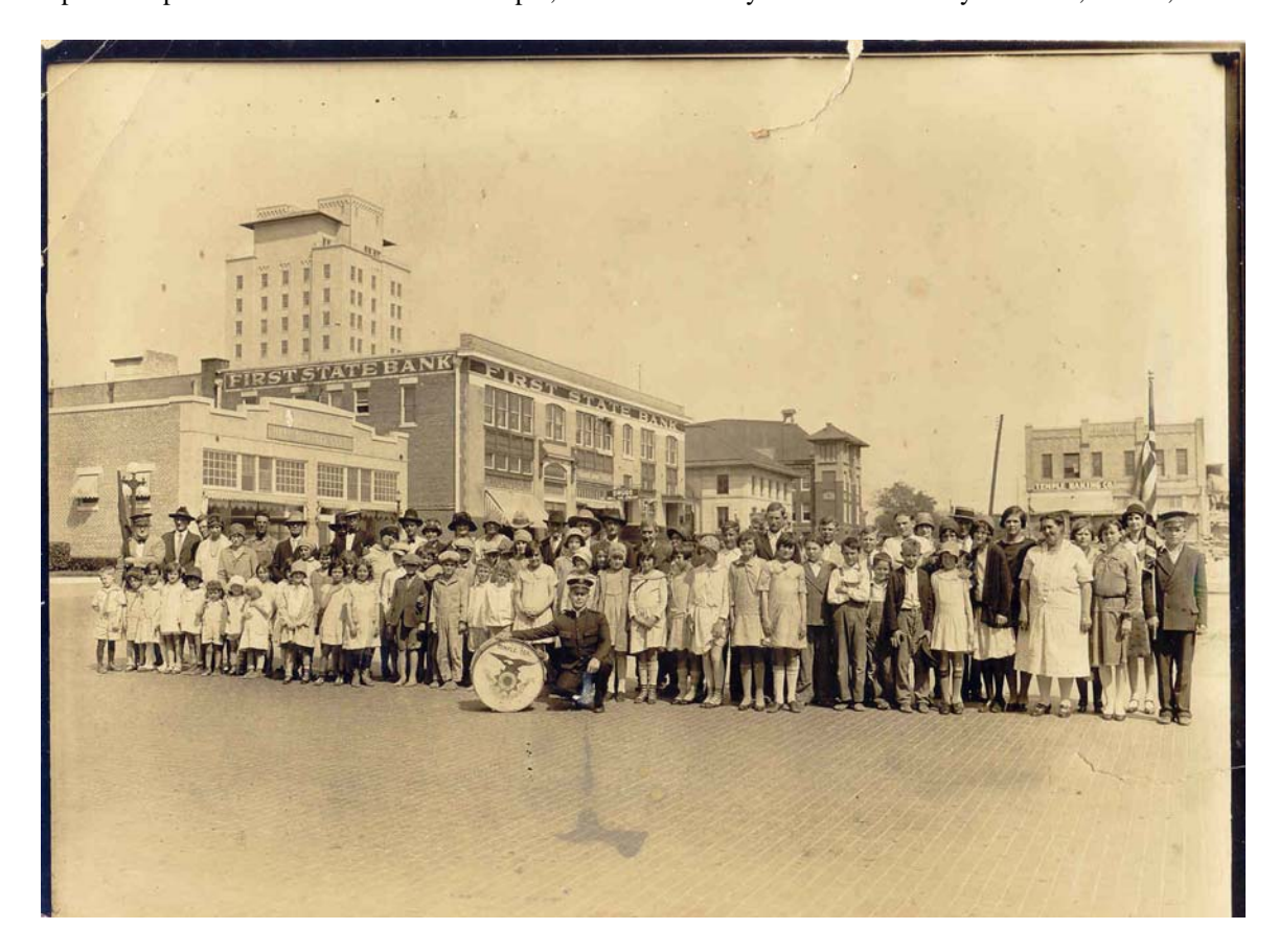
Figure 4. Group of Temple residents in downtown Temple, c. 1929.