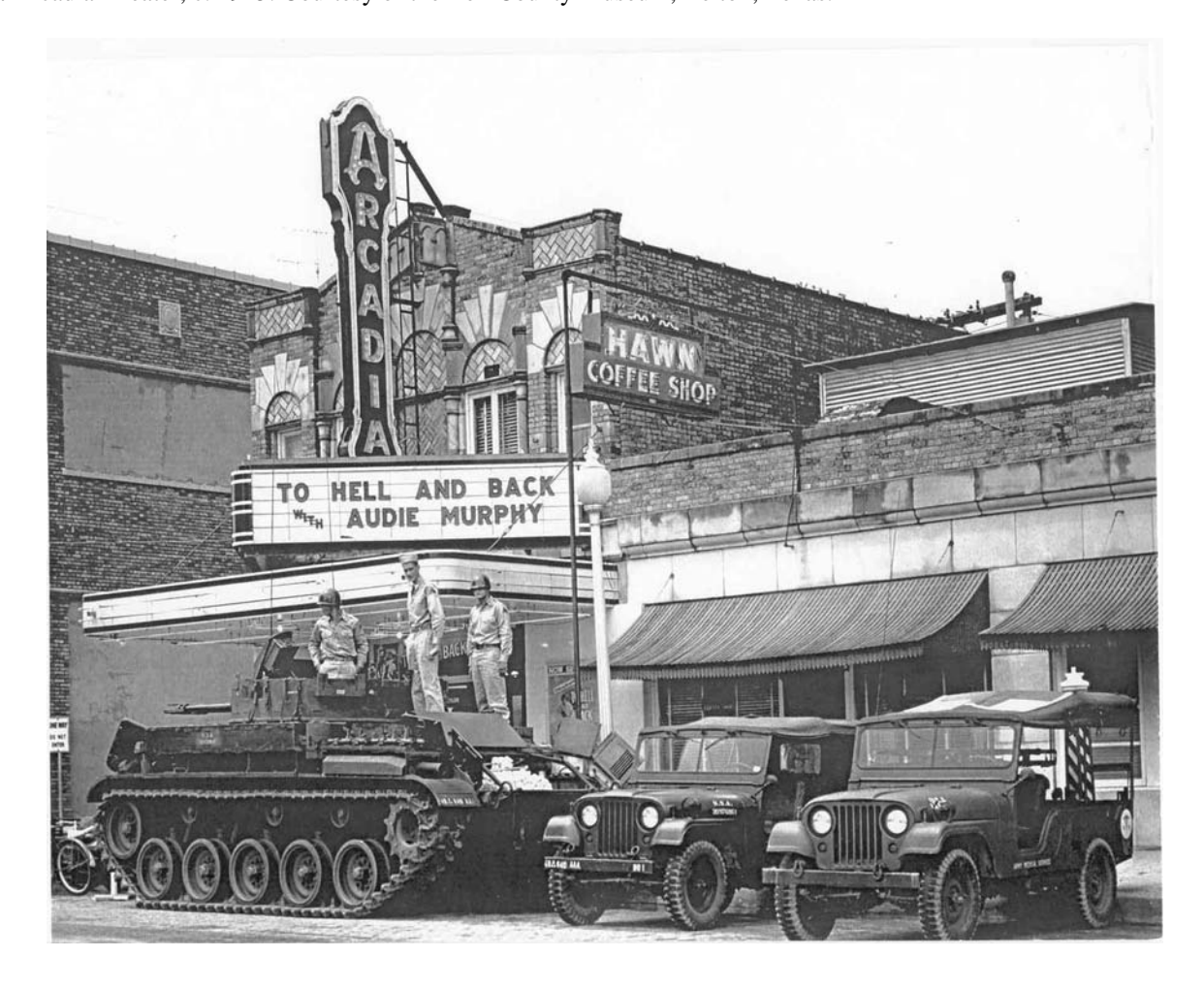
Figure 5. Arcadia Theater, c. 1945.